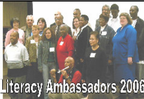
Literacy Ambassadors 2006

Forty participants will be selected to participate in the second Literacy Ambassador training program. Students will learn how to tell their story, build confidence, increase speaking skills, and learn how to be a local program Ambassador.