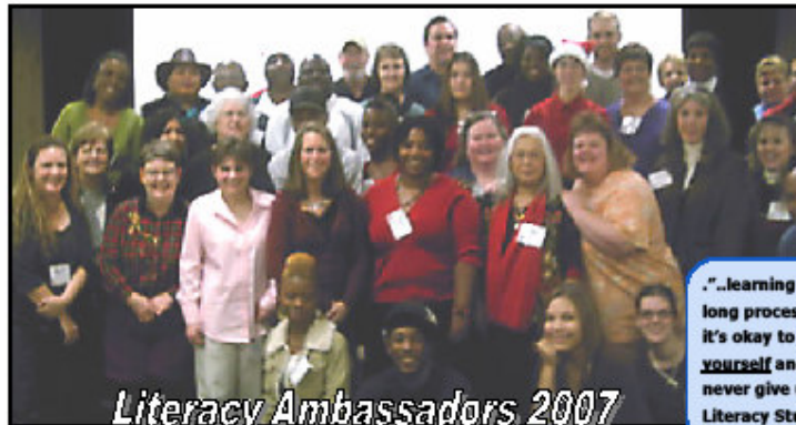
Literacy Ambassadors 2007

“...learning is a life long process, that it's okay to just be yourself and never never give up.” Literacy Student