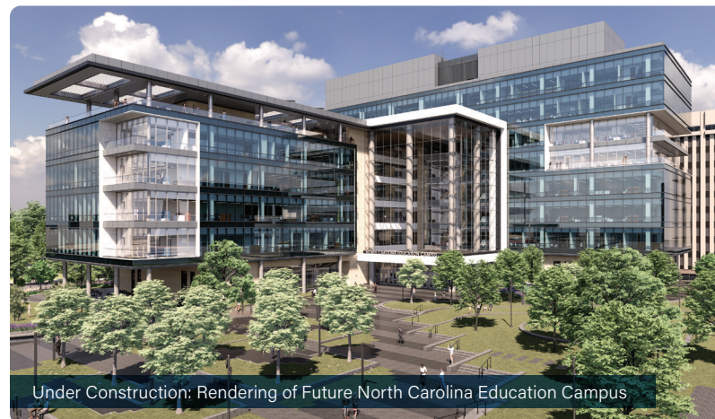
Under Construction: Rendering of Future North Carolina Education Campus

Leading the System requires alignment across 58 colleges with diverse needs. The President/CEO must set clear direction, align strategy and resources, and ensure the System operates with focus and discipline. This includes strengthening accountability, supporting innovation, and enabling the System to respond to workforce needs at the speed of business.