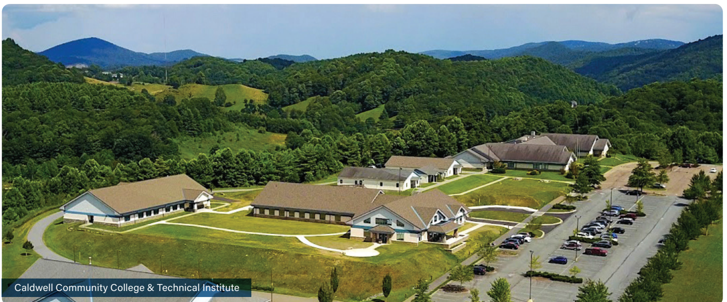
Caldwell Community College & Technical Institute

Each year, more than one in 14 North Carolinians enroll to build the skills and credentials needed to enter the workforce or advance their careers. At this scale, the System serves as the primary engine developing the workforce behind North Carolina's economic growth.